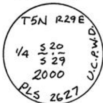
2" Aluminum Cap