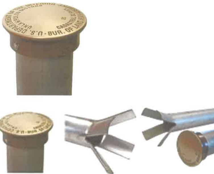
30" Iron Pipe Survey Monument (Flared) with 3.25" Domed Bronze Cap